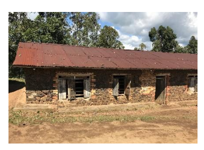
alte Klassenräume Kagera School

block with five classrooms and the teachers' room will follow. Due to the Corona protection measures, not all classrooms will be needed at the same time in the foreseeable future,