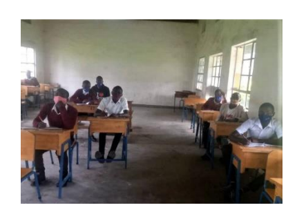
Examensklasse mit Sicherheitsabstand und Masken

So far, 40,000 people in Uganda have tested positive for the virus and 389 people have died from corona infection. Despite these extremely low numbers for a country of more than 40 million people, strict protective measures remain in place, such as mandatory wearing of masks in all public places and streets, restrictions on the number of people attending religious services and funerals, and the partial closure of schools.